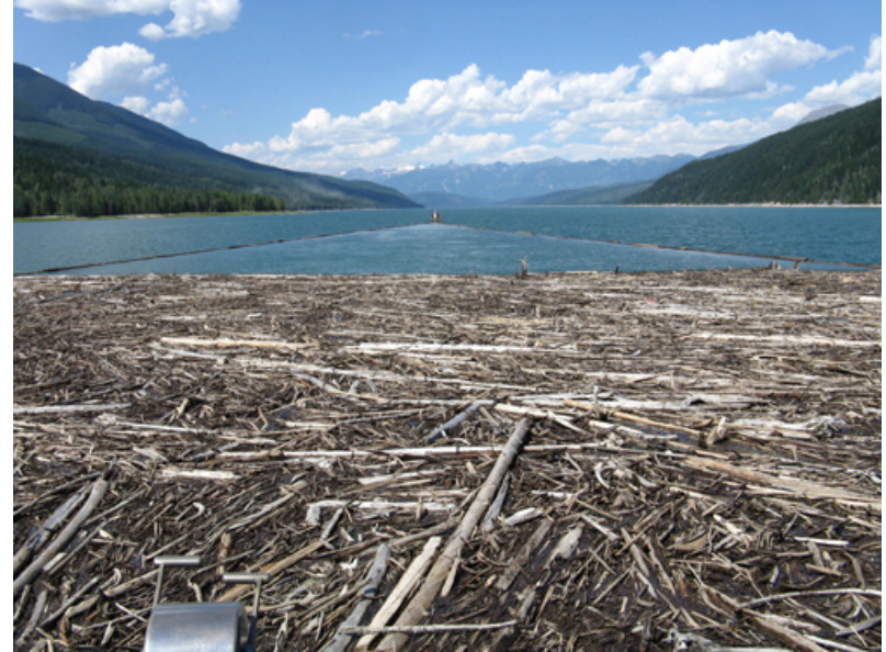
Driftwood (getting pulled by a boat as a log boom here)